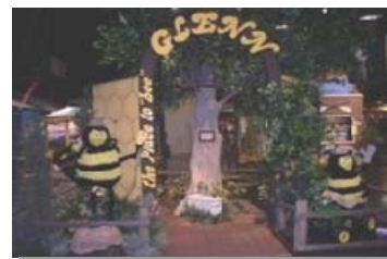
2005 State Fair Exhibit