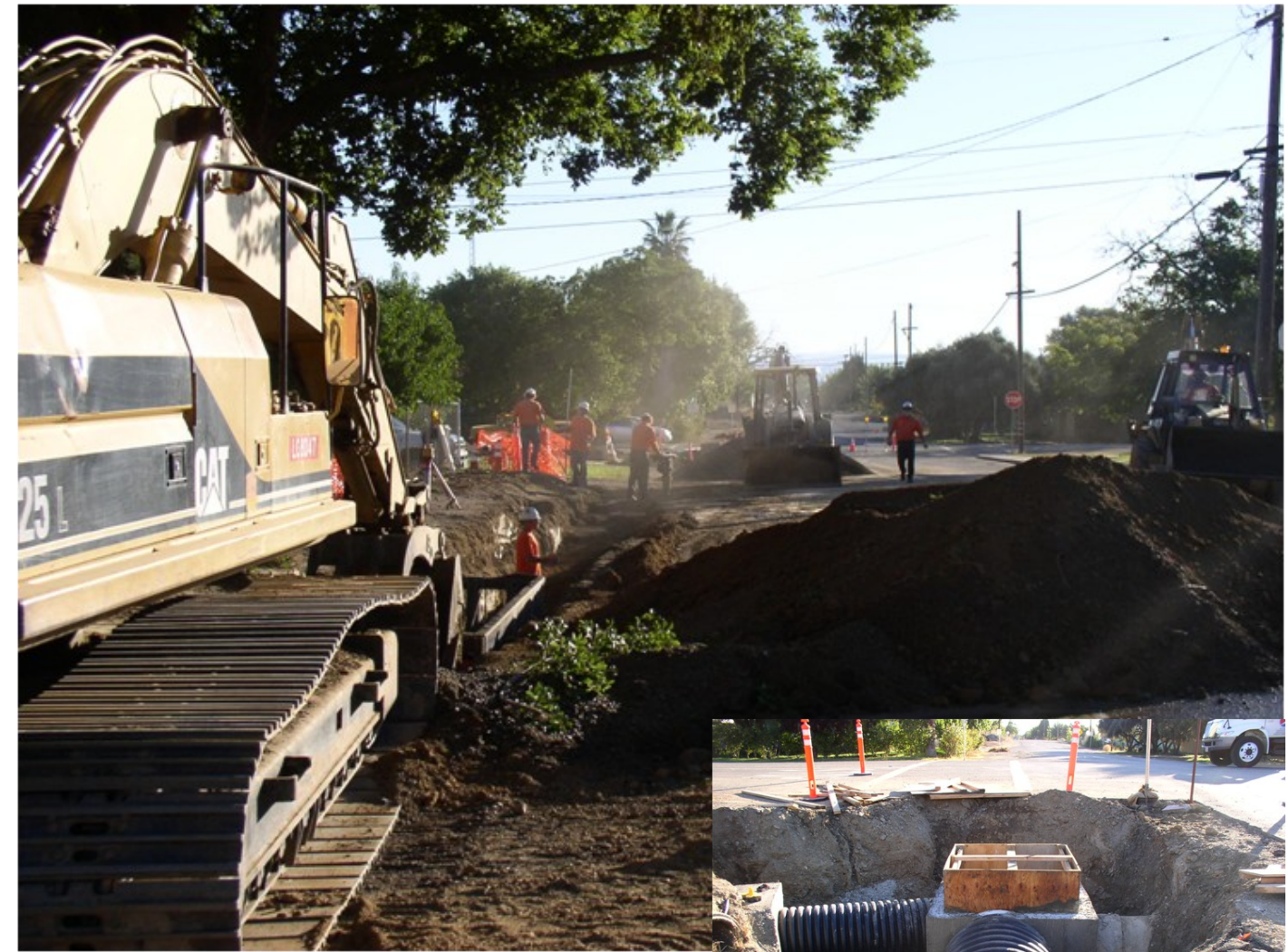
Above: Trenching on Fourth & Main in Hamilton City. At Right: Drain Inlet, also on Fourth & Main.