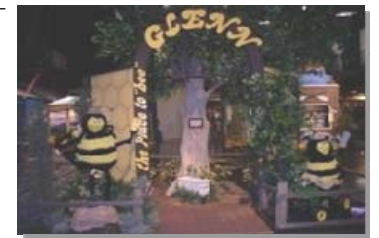
2005 State Fair Exhibit